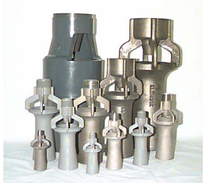
Table 1 Nozzle and Circulated Flow (usgpm) for ME Series Liqui-Jet Tank Mixing Eductors using 70 deg. F Water

ELMRIDGE 'ME Series' Liqui-Jet Mixing Eductors vigorously and efficiently circulate the liquid contents of tanks without powered impellers or other insertion-type rotating mechanical devices. ELMRIDGE 'ME Series' Liqui-Jet Mixing Eductors operate on the same principle as our standard line of liquid-powered Jet-Apparatus. Liquid is pumped through the Eductor nozzle, emerging at a relatively high velocity, creating a localized zone of lower pressure. Tank contents are drawn to this lower pressure zone, where the momentum of the motive liquid is transferred to the tank liquid, causing the tank liquid to be 'pumped' and circulated. For every gallon of liquid pumped through the Eductor nozzle, up to five gallons of liquid is circulated. Note that Eductors can actually be 'aimed' at specific areas in the vessel. Operating characteristics (Water Motive / Water Suction), for standard models are shown below, and special units are also available to meet your specifications. Standard materials of construction are Glass Reinforced Polypropylene, PVDF, PVC, CPVC, Teflon®, Cast Iron, 316 Stainless Steel, Alloy 20, and Hastelloy C®. Other materials are available upon request. Threaded, flanged, or socket weld connections (except Cast Iron).